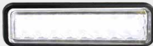
Part Number 135WMG - Multivolt 12-24V, Blister single