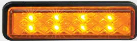
Part Number 135AMG - Multivolt 12-24V, Blister single