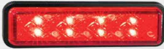
Part Number 135RMG - Multivolt 12-24V, Blister single