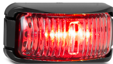
Part Number 42RM - Blister Single 42RMB - Bulk box of 10

Approvals Function Category CRN ADR Rear End Outline 49/00 42839 ADR Side Direction Ind 6/00 Cat5 42836 ADR Side Marker 45/01 42837 ADR Front End Outline 49/00 42840