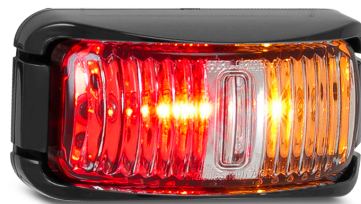
Part Number 42ARM - Blister Single 42ARMB - Bulk box of 10