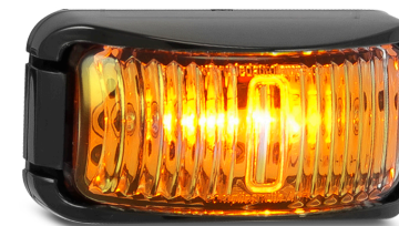
Part Number 42AM - Blister Single 42AMB - Bulk box of 10