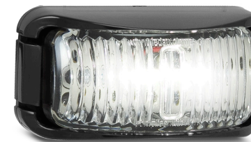
Part Number 42WM - Blister Single 42WMB - Bulk box of 10