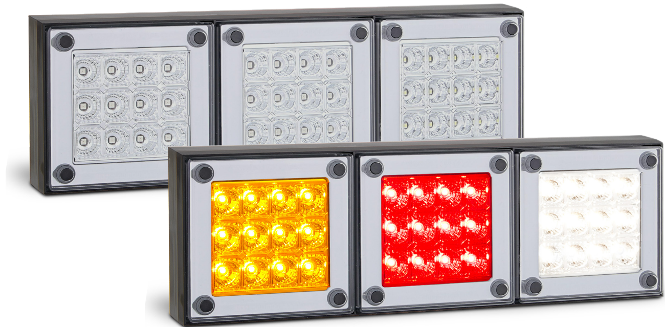
Stop/Tail/Indicator/Reverse 280TARWM - Single Blister