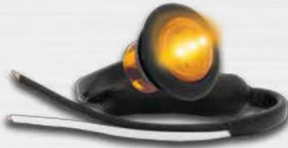
Part Number 181AME - Multivolt 12-24V, Blister single