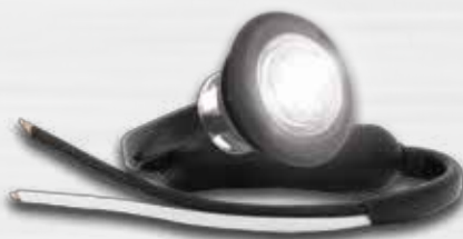
Part Number 181WME - Multivolt 12-24V, Blister single