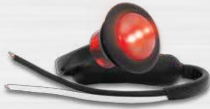
Part Number 181RME - Multivolt 12-24V, Blister single